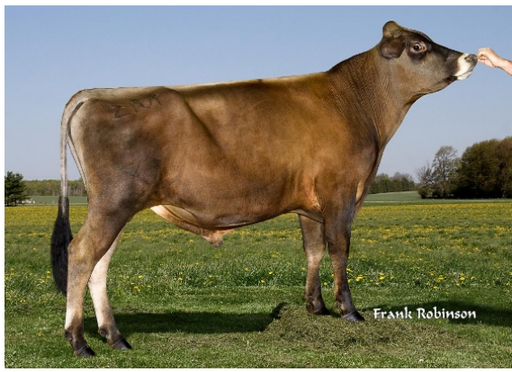
CAL-MART CHART PADEN 4218