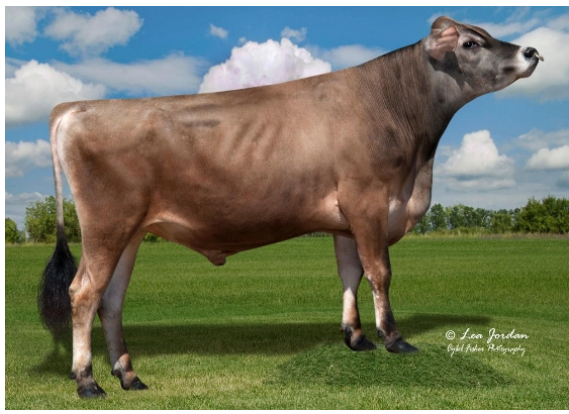
JX WILSONVIEW SWORD MULTIPLY