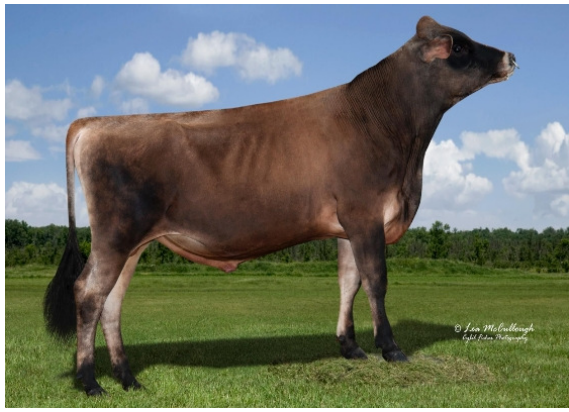
Forest Glen Premium Gold