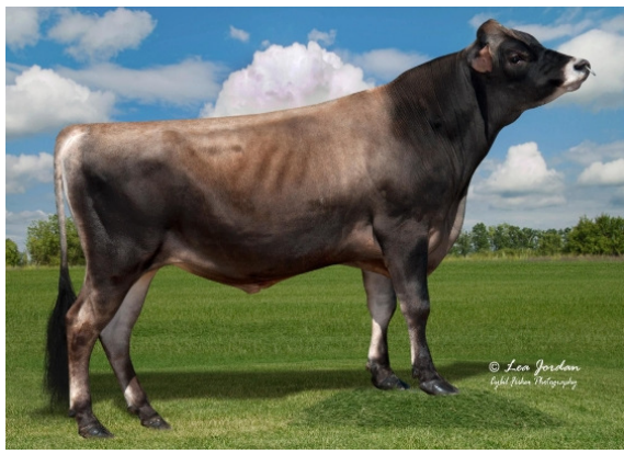
PETERSON REGENCY LEON