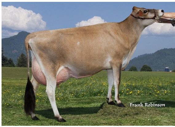
Pearlmount Restore Dixie (dam of River Valley Detroit)