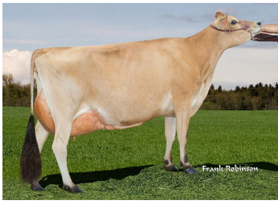
Gr Wilsonview Garden Sunday, Dam of Stormy