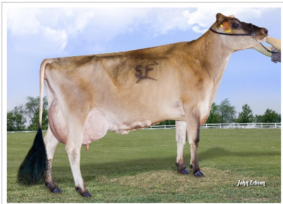
Pr Faria Brothers Action Dean (dam of Barksdale)